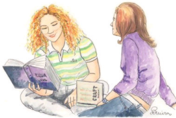
Figure 2. The girl to the left is reading aloud from her book while the girl to the right is listening attentively. One body of research suggests that essentially the same comprehension processes are involved in these two activities. However, if the two girls are starting a conversation with each other, new pragmatic and socio-cognitive processes are likely to be activated. (Painting by Amira Bavec; printed with her kind permission.)

also captured in the simple view of reading. There is not total consensus on this view, though. For example, Pressley (2002) argued that skilled readers apply certain meta-cognitive strategies, above their general comprehension skills, to make sense of written text specifically. Supporting the simple view, Keenan, Betjemann and Olson (2008) performed a factor analysis on measures of word decoding and reading and listening comprehension, and found that listening comprehension loaded on the same factor as (most of the) tests of reading comprehension, but separately from word decoding. See Figure 2 for an illustration with descriptions of the points made this far.